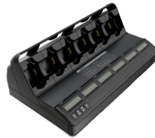
IMPRES 2 Multi-Unit Charger NNTN9115