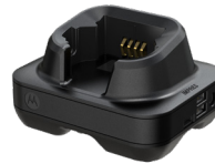
IMPRES 2 Single-Unit Charger NNTN9199